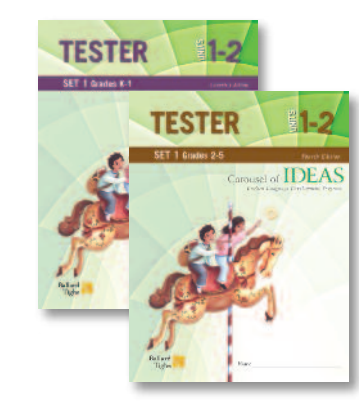
Carousel Testers (A formal assessment tool)